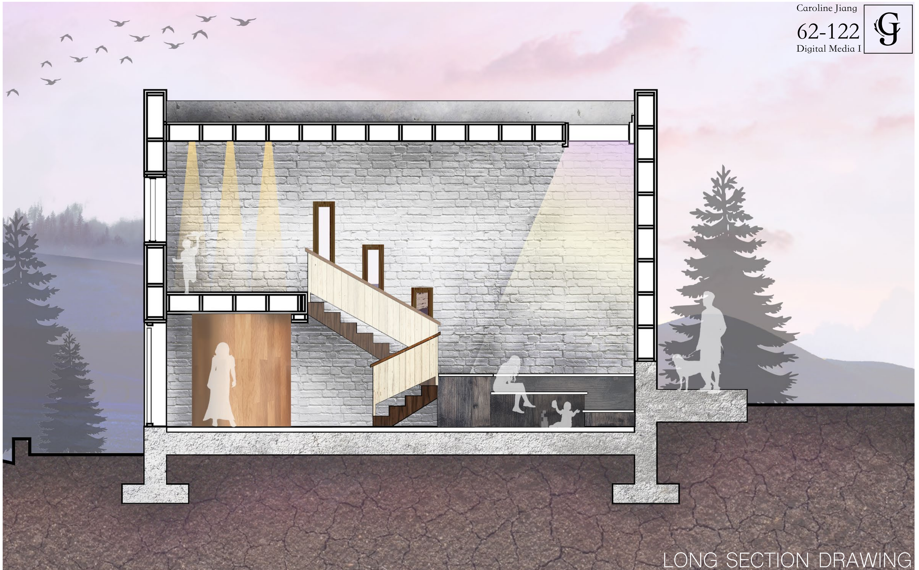
LONG SECTION DRAWING